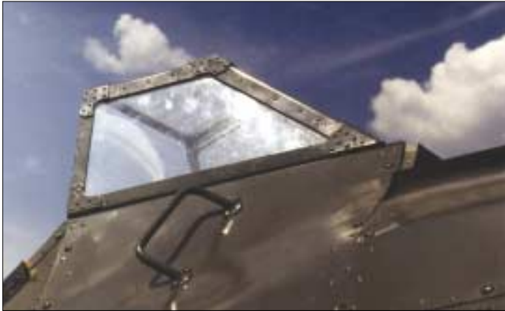
Cockpit entry handle, starboard view.