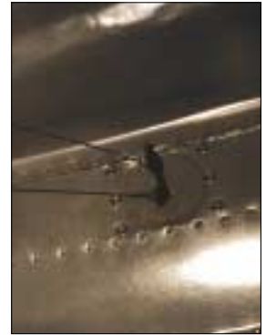
Attachment of the aerial cable immediately aft of the cockpit on the starboard side.