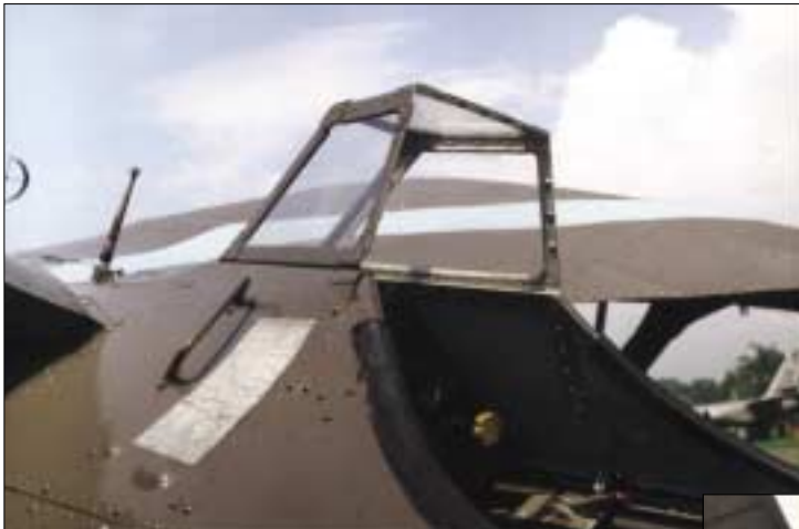
Windscreen port view.