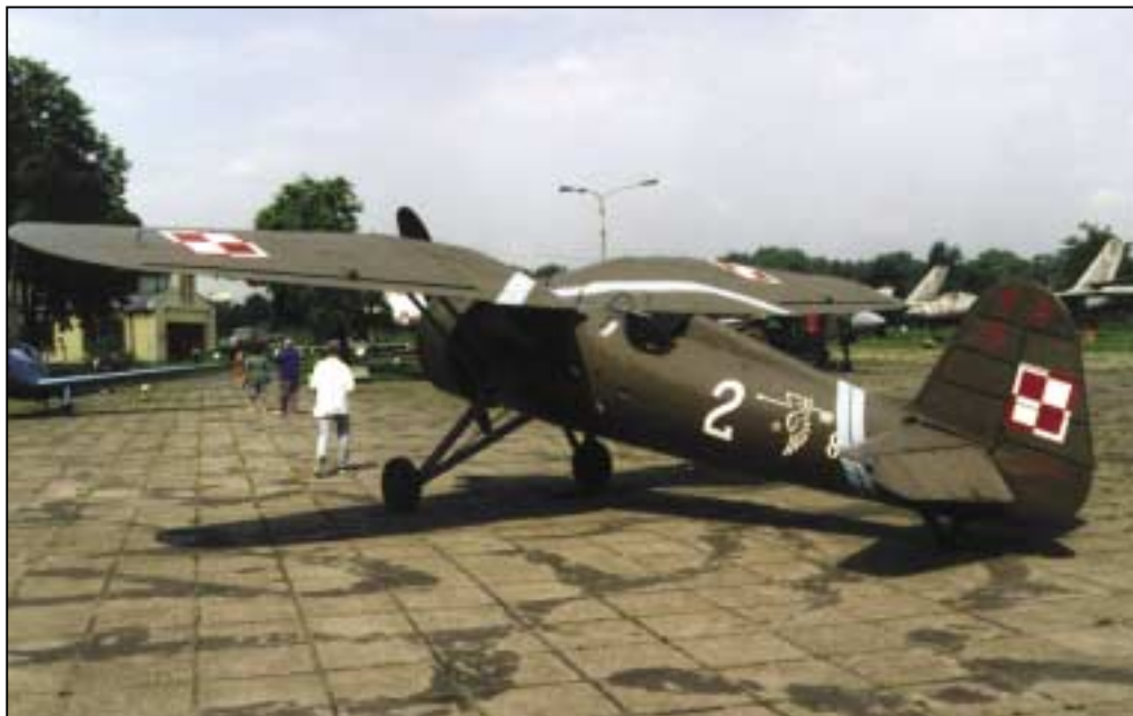
Entire aeroplane as seen in front of the hangar of the Polish Aviation Museum in Cracow.